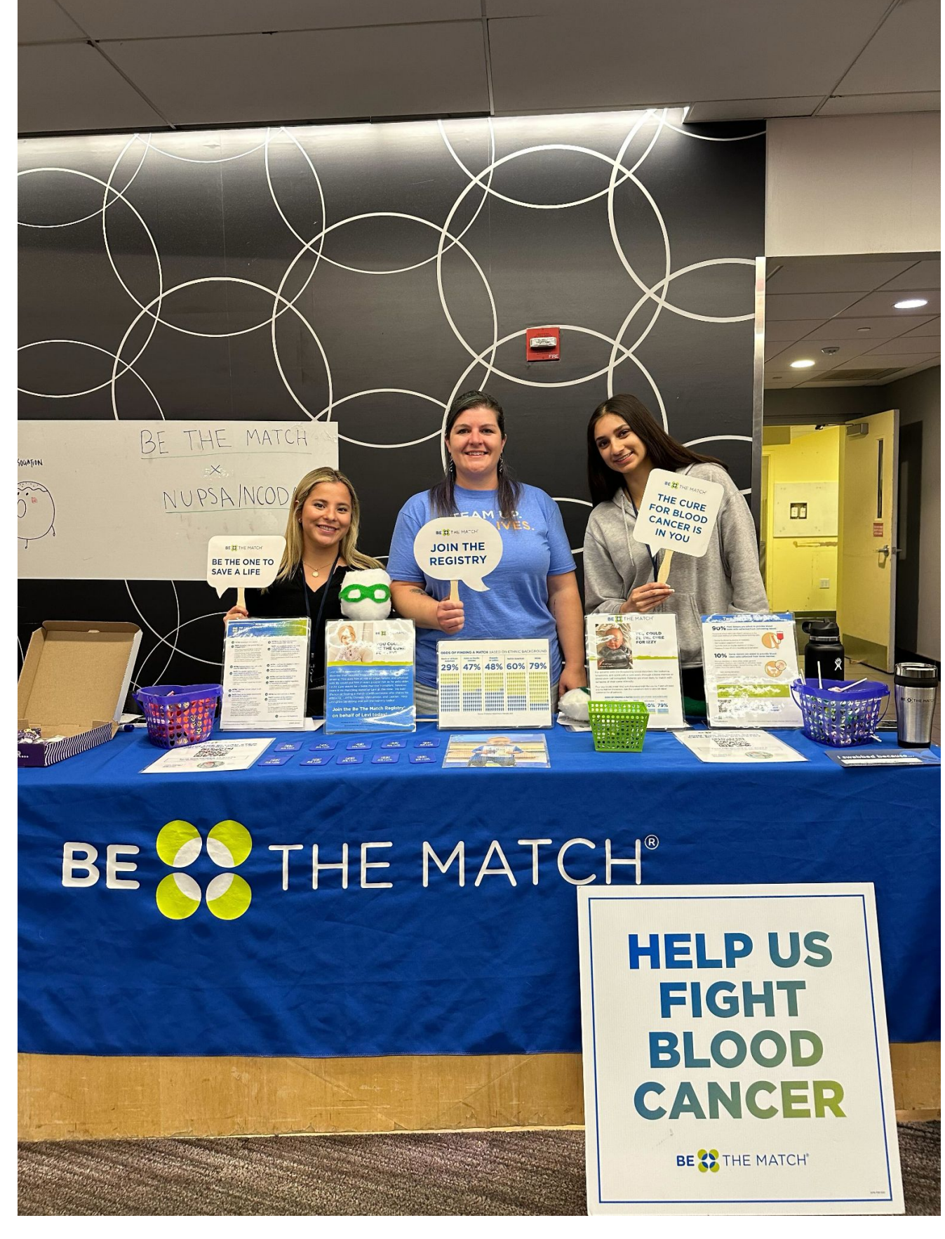
Pictured Above: Students at Northeastern University and University of New Mexico Hosting Blood Drives