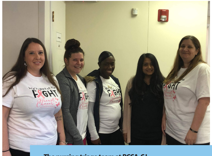
The nursing triage team at RCCA-CJ.