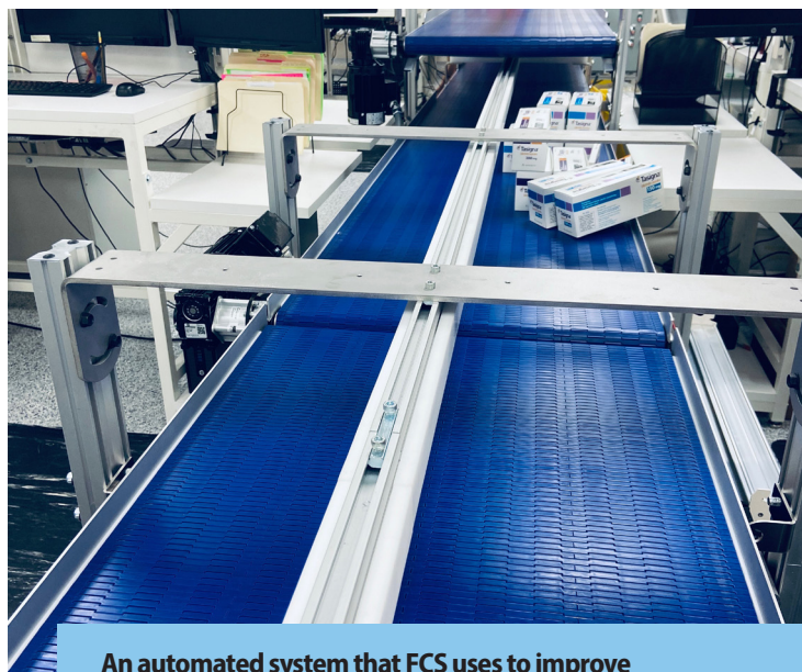
An automated system that FCS uses to improve prescription filling efficiency.